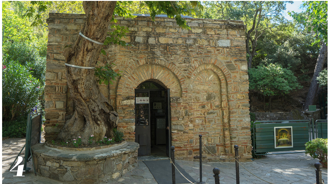
The House of the Virgin Mary located on Mt. Koressos near ancient Ephesus in Turkey.

To view online, donate, and join our e-mail list please visit: www.glorymagazinewv.com