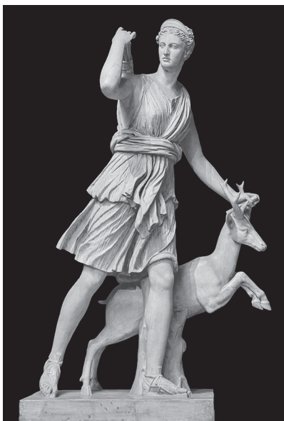
Ancient sculpture of Diana (Artemis)