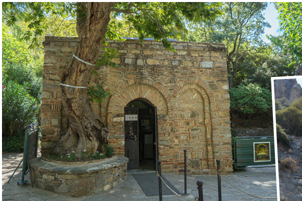
Top to bottom: The House of the Virgin Mary thought to be the last place Mary resided is located near ancient Ephesus in Turkey; The statue of the Virgin Mary stands in the courtyard; The Wishing Wall to the side is where visitors place small notes containing their hopes and wishes.

Ephesus, Jesus says, has endured and possesses constancy and patience. They have labored and not grown weary; still, they are “found wanting.” They had left