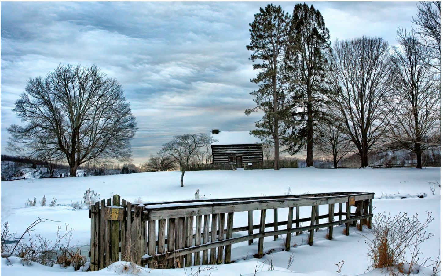
Cabin at Jackson's Mill Historic Area during winter in Lewis County, WV