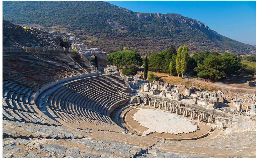
Amphitheater ruins in ancient city Ephesus, Turkey

Left: The ancient ruins of the Temple of the Goddess Artemis (Diana) in Ephesus, with a stork nest atop the pillar on the right. Right: The Amphitheater in the ancient city of Ephesus.