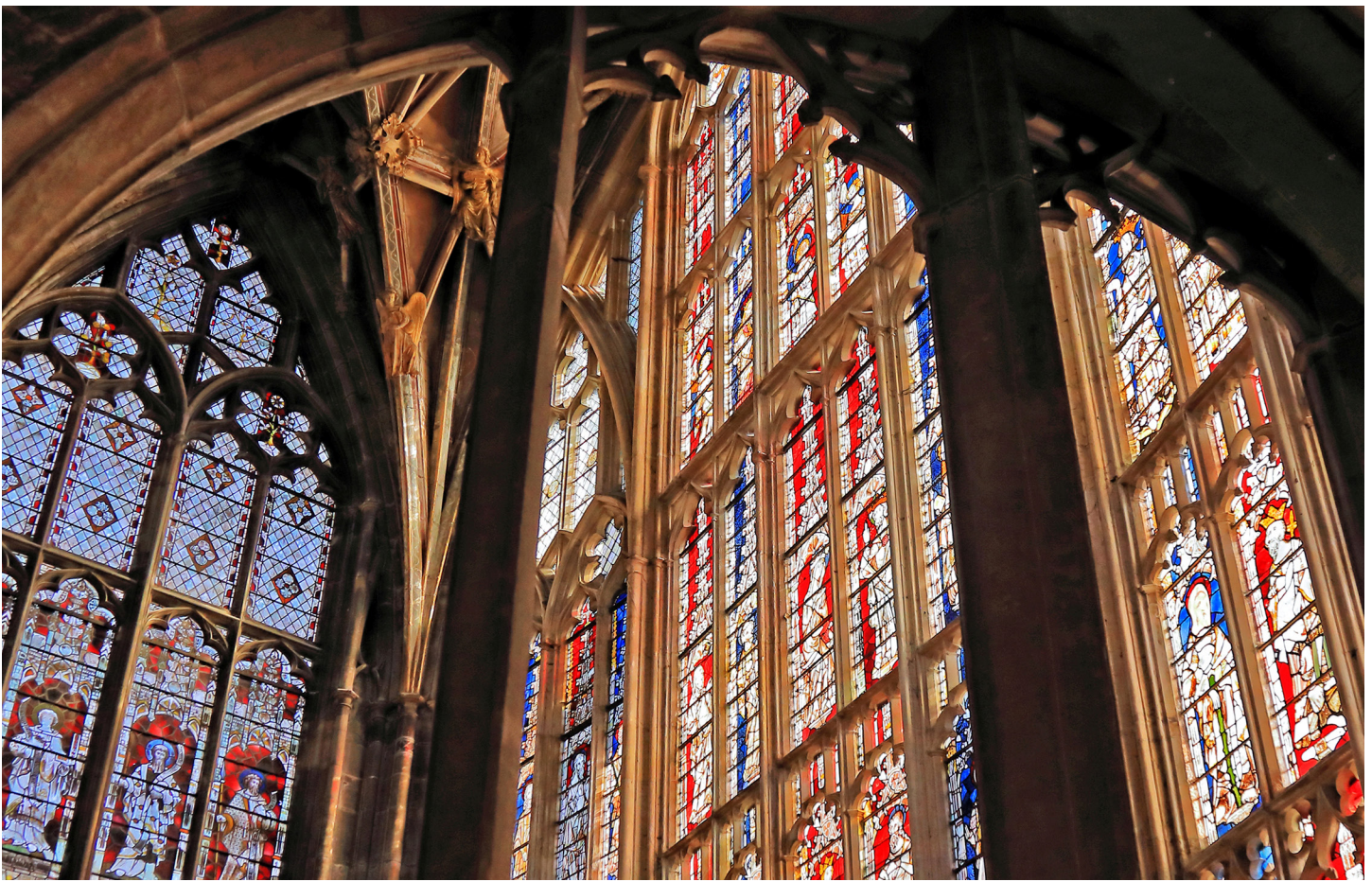
Windows at Gloucester Cathedral : © Backward Photography, Alan Tucker