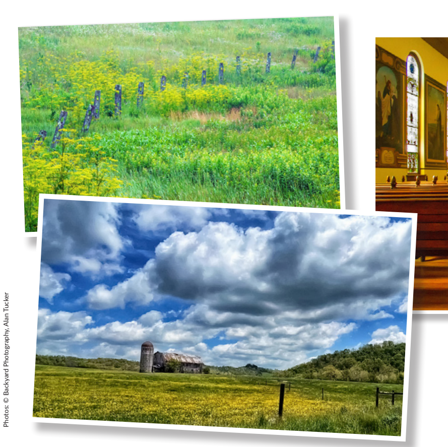
West Virginia Scenic Highway, Mountain Meadow, Pocahontas County, WV; Georgetown Road Barn, Harrison County, WV; International Mother's Day Shrine, Grafton, WV

the early Saints and from God's work through them. Even in Chronicles, God's wisdom comes through.