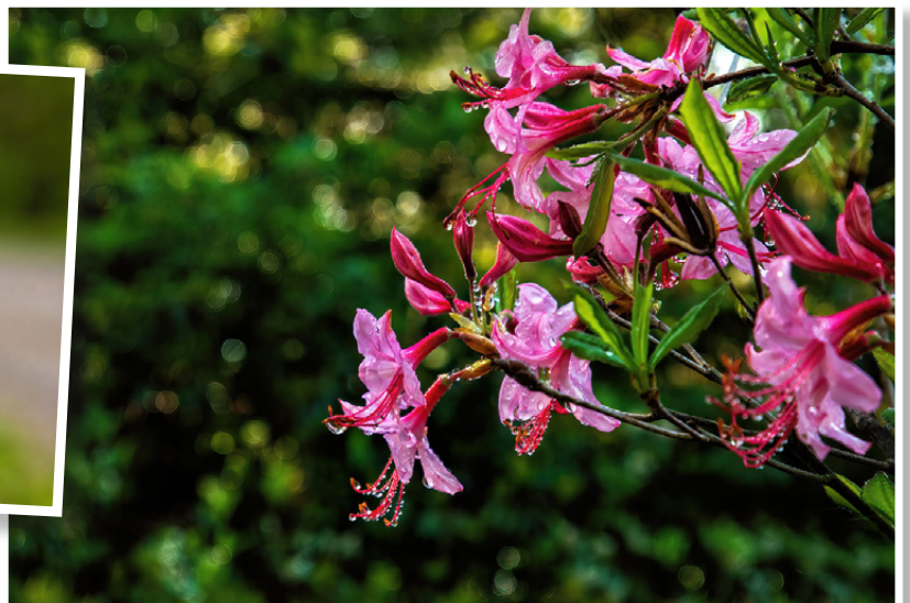
Above: Wild Columbine, Pocahontas County; rt: Wild Azaleas, Tucker County