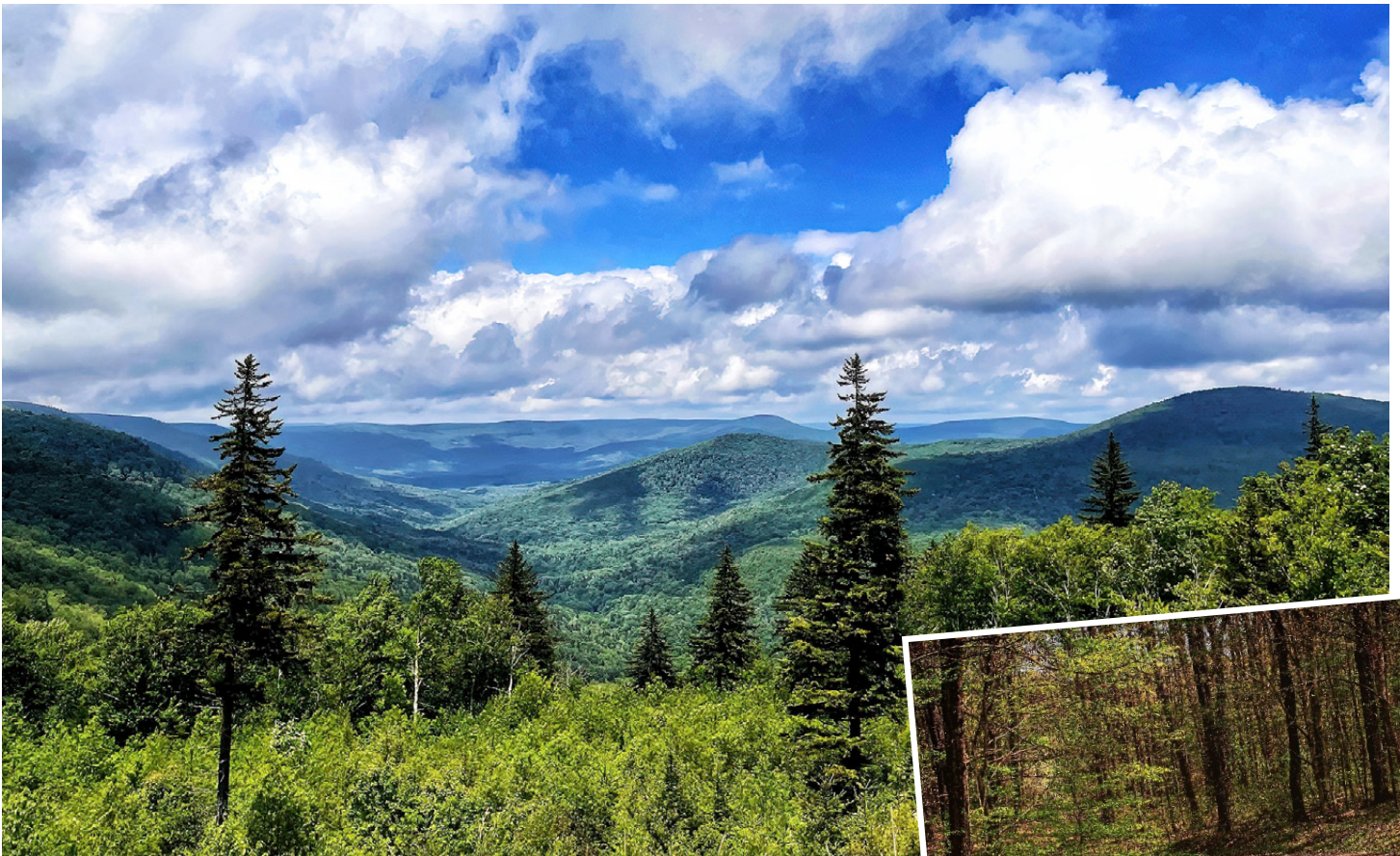
Above: Scenic Highway Overlook, Pocahontas County; Right: Fire Tower Road, Tucker County