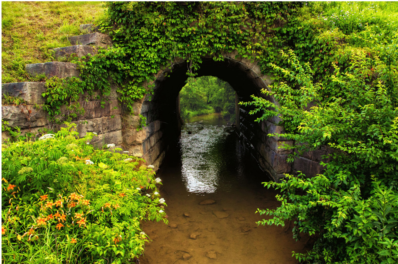
Old Railway Bridge Near Elkins, Randolph County