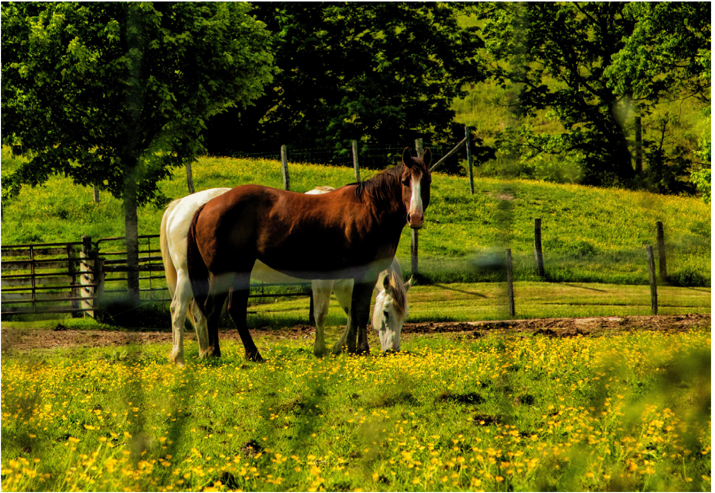
Farm Scene near Elkins, Randolph County