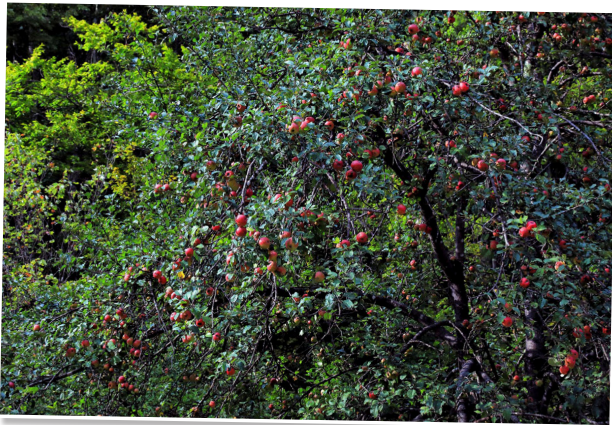
An abandoned farm apple tree, Randolph County