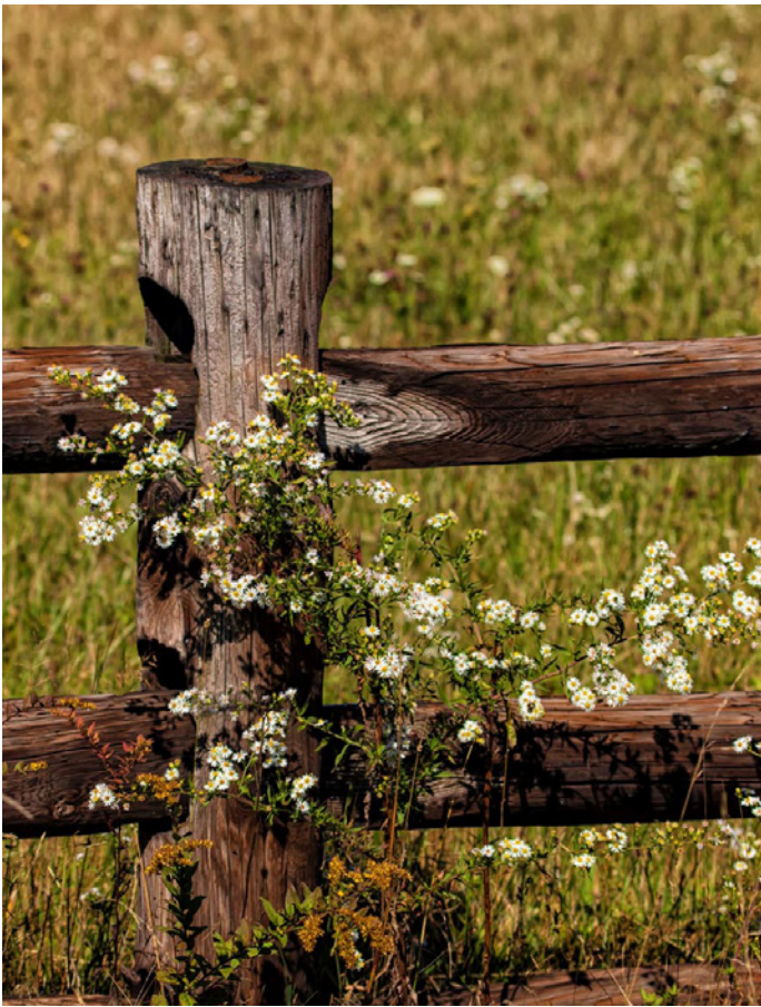
Above: Scenic Highway, Pocahontas County; Below: Milkweed gone to seed, Upshur County