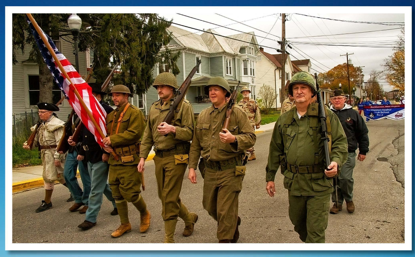
Left: Tomb of the Unknown Soldier, Arlington, VA; Above: 2017 Buckhannon Veteran's Day Parade

Happy Veteran's Day. It is the morning of November 11, 2024, as I sit here to begin writing my ongoing testimony of my walk with Jesus. Today is a special day across our country as we honor the service and sacrifice of all United States Armed Forces military veterans. Special events and solemn services occur across our land, with many communities holding parades, breakfasts, and other thank-you events for their veterans. Annually, most churches honor their vets during Sunday services, and more and more restaurants are now offering free meals for vets on this day. It is a special day, as it should be. The sacrifice for our freedom has been tremendous, and it is fitting for all to say thanks to those who served.