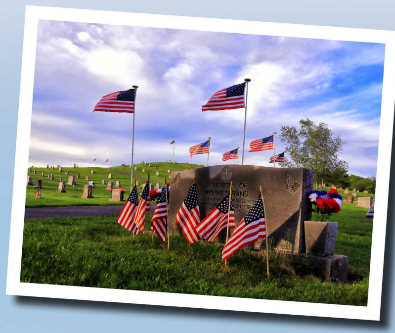
Heavner Cemetery, Buckhannon

"I, (state your name), having been appointed a (rank) in the United States Air Force, do solemnly swear (or affirm) that I will support and defend the Constitution Of the United States against all enemies, Foreign and domestic, that I bear true faith and allegiance to the same; that I take this obligation freely, without any mental reservation or purpose of evasion; and that I will well and faithfully discharge the duties of the office upon which I am about to enter. So, help me God."